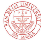
San Beda University (SBU), Philippines